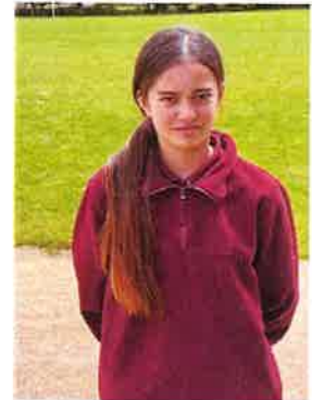
Rylee Academic Star