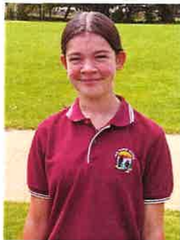
Meadow Honours Badge